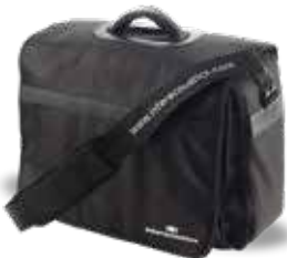
The soft carrying case