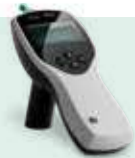
MT10 Handheld tympanometer