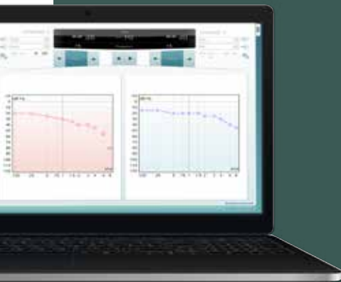
Diagnostic Suite software (AS608e only)