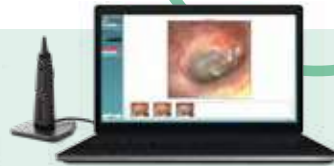
Viot™ Video otoscope