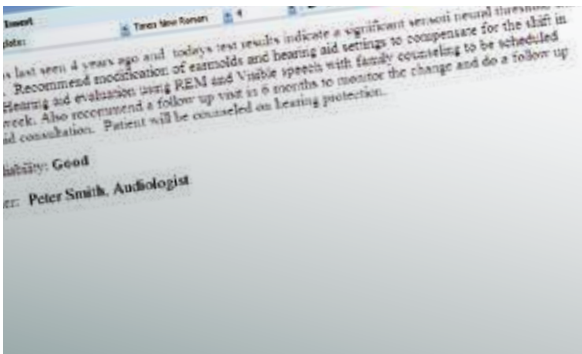
Report page from the Diagnostic Suite (AS608e only)